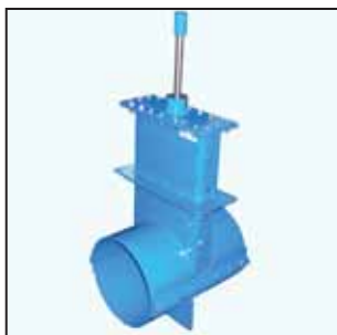
Optional in-line valve provides a positive shutoff to prevent backflow.